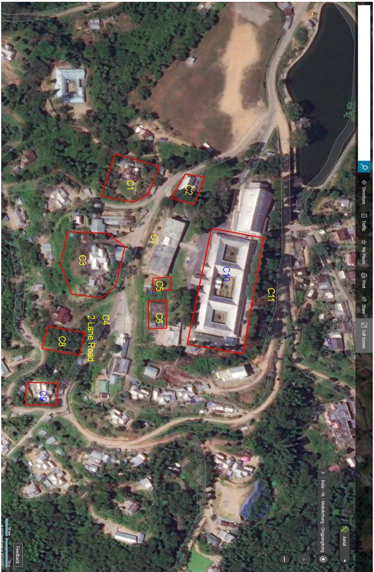
SITES FOR CONSTRUCTION/DEVELOPMENT ACTIVITIES